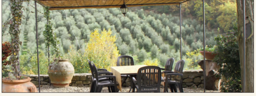
The al fresco "tasting room" at Podere Cogno, overlooking a magnificent olive grove.

Fortunately, we were on the spot between November 10th and