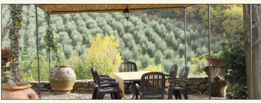
The al fresco "tasting room" at Podere Cogno, overlooking a magnificent olive grove.

place to get great oil. Today, they may have become the only places, as these havens from summer heat also offer older trees and cool autumn nights, and are much less accessible to the dreaded olive fly that can wipe out a year's crop.